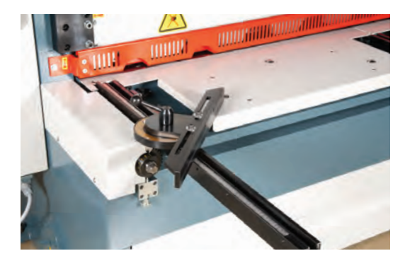
Adjustable Angle Stop 0-180° Finger Guard Ball Transfer Table Hold Downs with Rubber

Backlash-free operation high torques at operating cycles Maintanence free