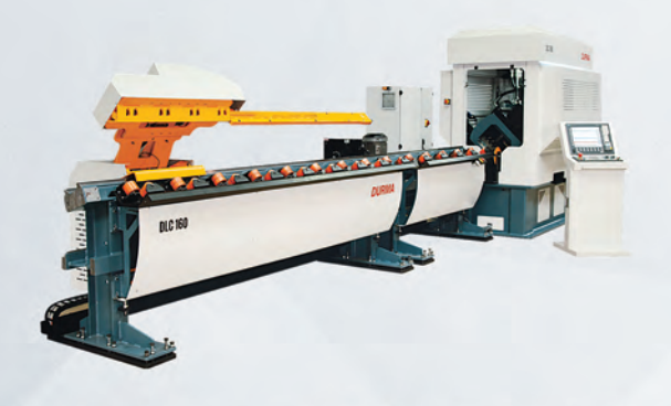
L ANGLE PROCESSING CENTER