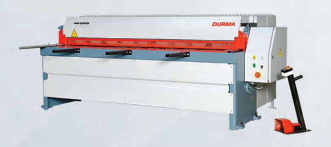
POWER OPERATED SHEAR