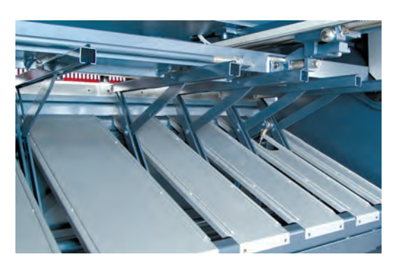
Thin Sheet Support System