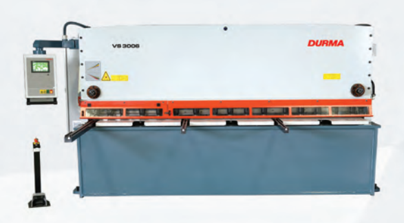
VARIABLE RAKE SHEAR