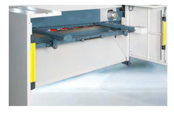
Curtain Light Guards