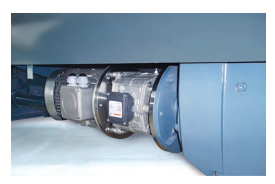
DURMA magnet brakes and clutch system to your starting, stopping, positioning, controlling and regulating requirements.

Compact, high performance integral gear motors. Permanent magnet brakes and clutches for dry operation.